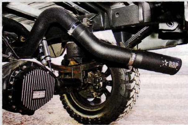
Exhaust fumes exit out the back through a 5-inch RBP all-black turbo-back and the rear axle has Deaver springs and Firestone airbags on custom perches.

Offroad looked to Audio Connections in Wichita Falls, Texas, to add some entertainment to the interior. The in-dash Kenwood KVT-717DVD provides movie playback, and the two 10-inch subs under the rear seat powered by a Kicker amplifier fill in the low notes.