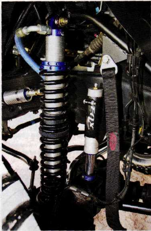
A custom Rock and Roll Offroad four-link conversion with Fox 2.5 coilovers and Fox 2.0 bump cans that allow for 12 inches of suspension travel was installed on the front of the pickup.